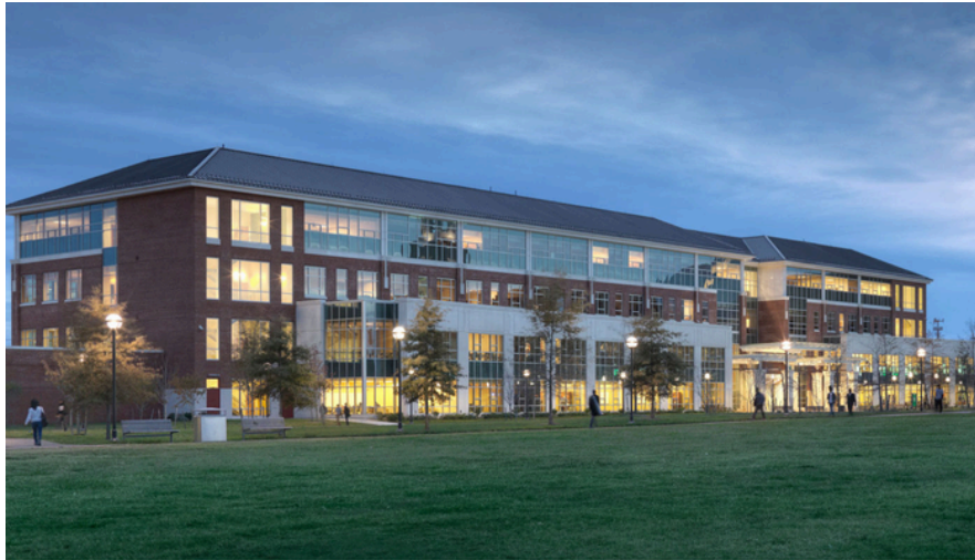
Nursing & General Education (NGE) Building

Visitor parking is available behind the NGE Building, directly beside the Marty Miller Baseball Field.